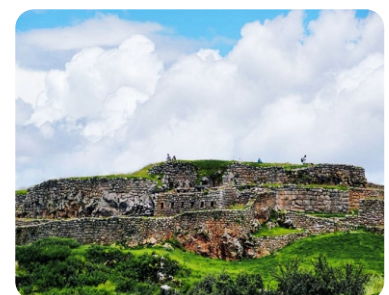
TRAVEL TIP | PUCA PUCARA It means "Red Fortress" in Spanish.